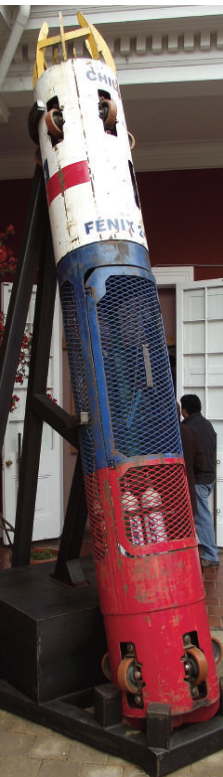
The rescue capsule used bring the men to the surface